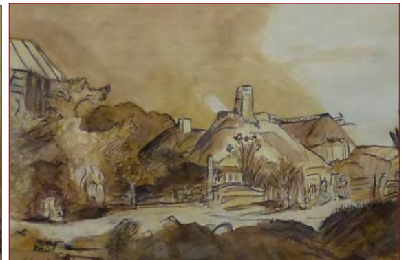
WATERCOLOUR 2 Cottage under Stormy Sky (Rembrandt) Karen Hall