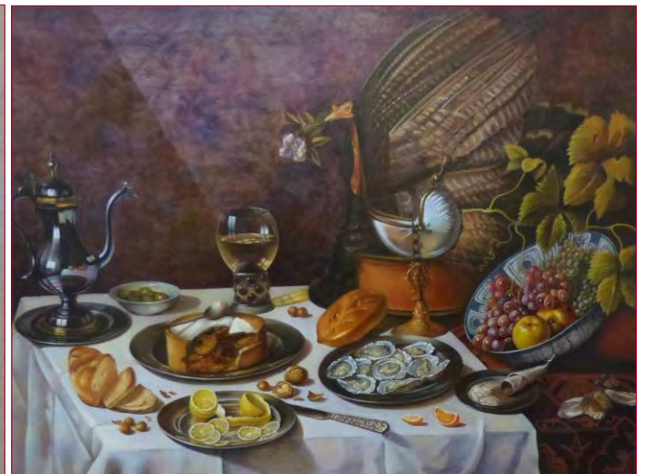
OIL Turkey Pie (Pieter Claesz) Vavara Naumova