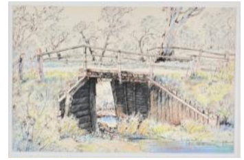
4th DRAWING Isla Patterson