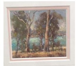
2nd MINIATURE Sandra House