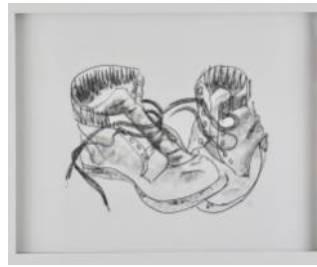
3rd DRAWING Patricia Fleming