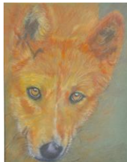
2nd ANIMAL Belinda Ingram

What a happy expression on this dog's face! Excellent use of the medium, good composition and tones.