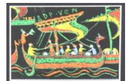
3rd MINIATURE Diane Alder