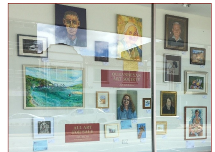
Plaza window changed every month.

With on average 120 works in every monthly QAS Art Competition/Exhibition the Gallery has proven a wonderful venue for sales. (left)