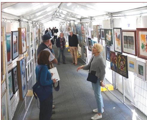
City Walk, Canberra Art Show.

The Riverside Plaza window is also selling well. (above right)