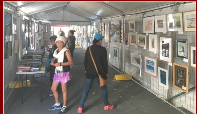
QAS Art Marquee City Walk, Canberra

QAS has a great active membership of Gallery Painters who use the new $120,000 Working Gallery with the high ceiling, bright atmosphere and delightful company. We look forward to seeing you there!