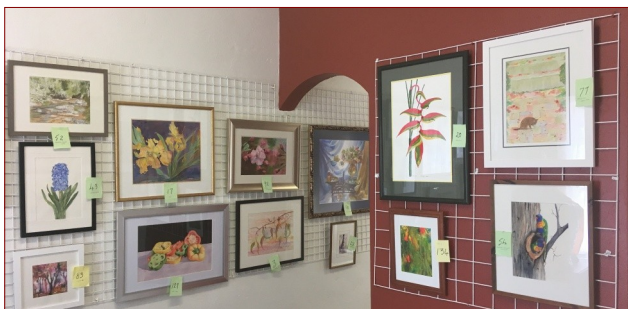
QAS Gallery open every day-New Exhibition every month.

QAS made record art sales at a variety of venues in 2018.