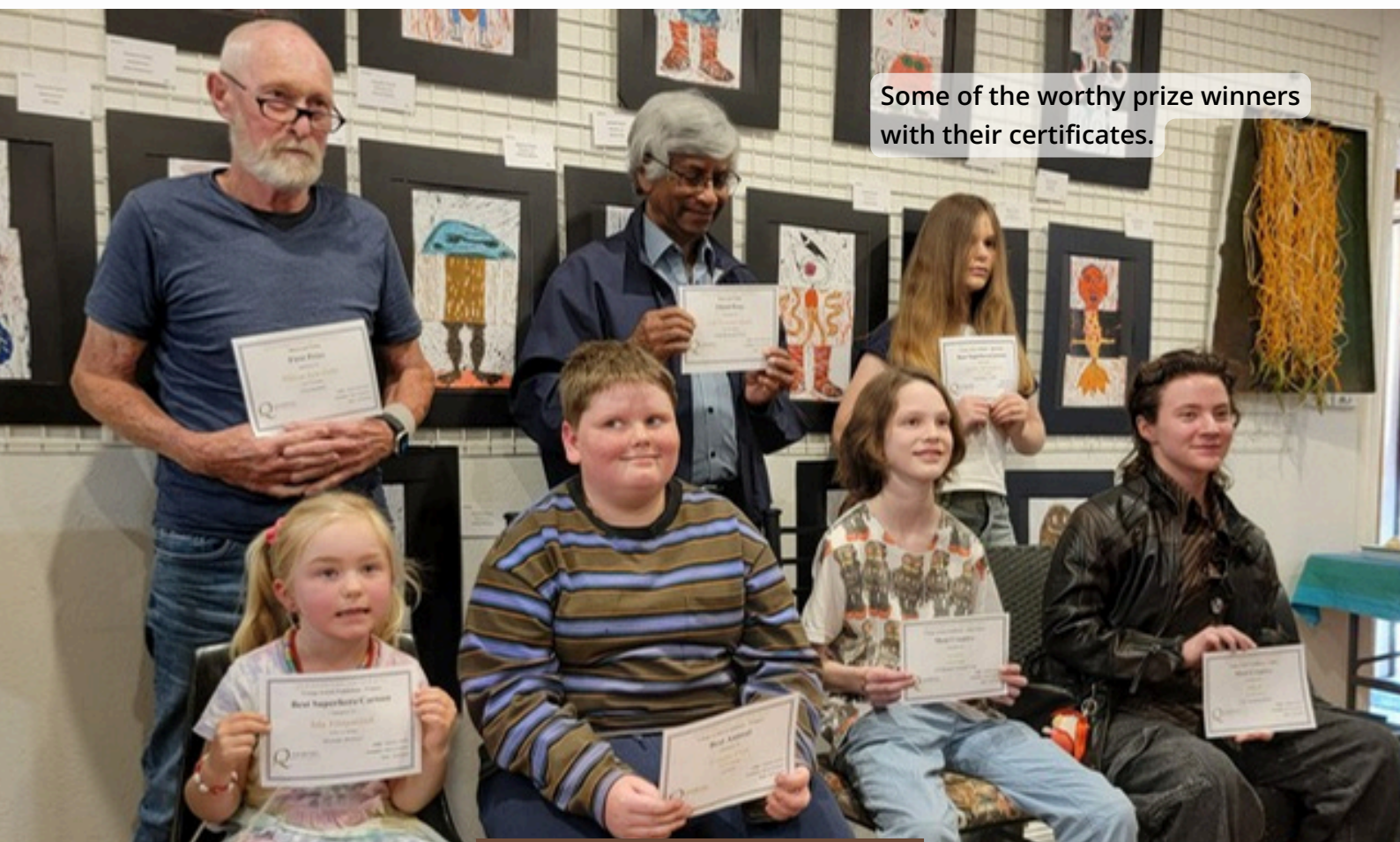
Some of the worthy prize winners with their certificates.