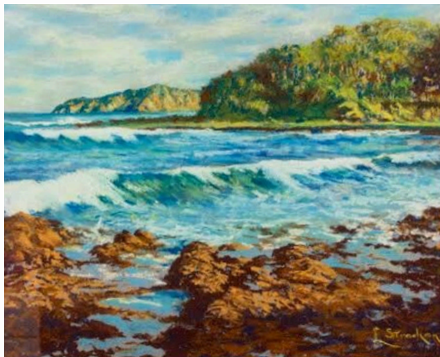
Some examples of Eric's pastel artwork.