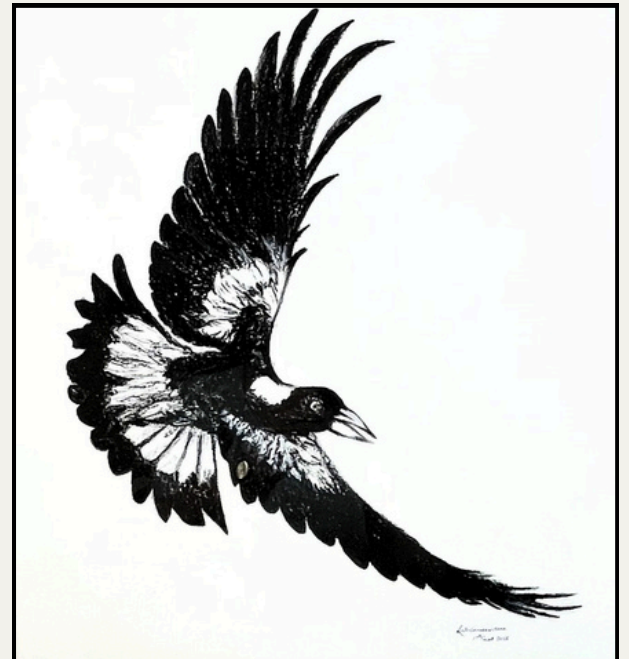
3rd Prize: Flying Black and White , Lal Warusevitane