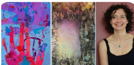
Leigh Walker 2 Day Abstract Painting Workshop