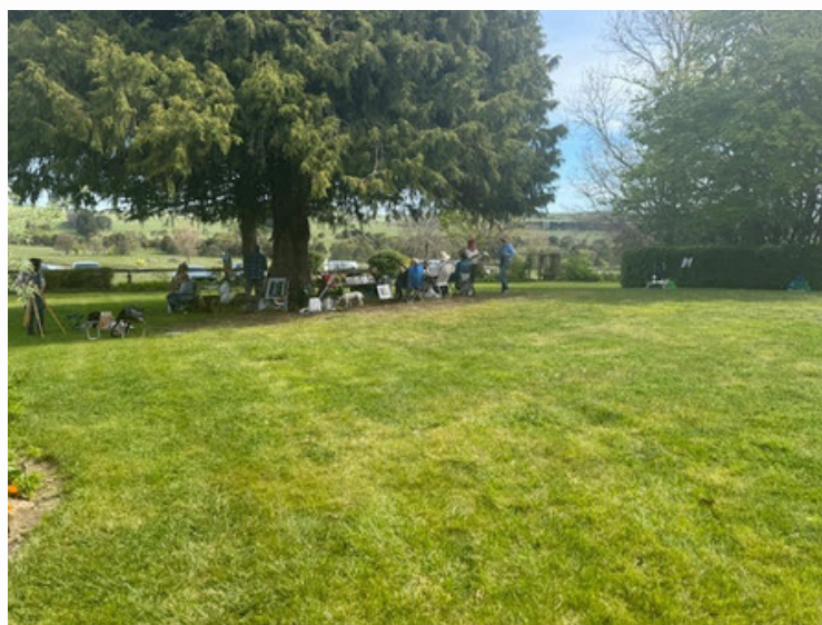
A glorious day for painting and a magical spot.