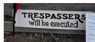
The 'welcome sign' at the entrance to Bedervale Homestead.