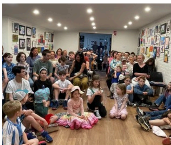
It was a packed house for the launch of Black & White and the Young Artists. Read all about it inside...

The biggest thanks go to all the wonderful artists who entered these two exhibitions. Overall, your efforts made this month's exhibitions a success, showing the true spirit of our art community.