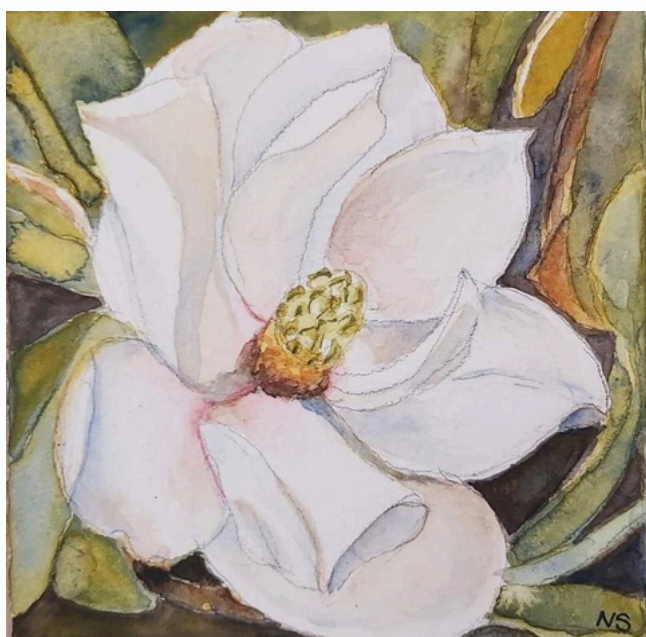
White Magnolia, Watercolour, 23 x 23cm