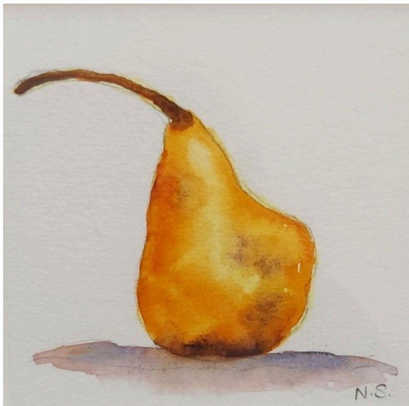
Golden Pear, Watercolour, 23 x 23cm