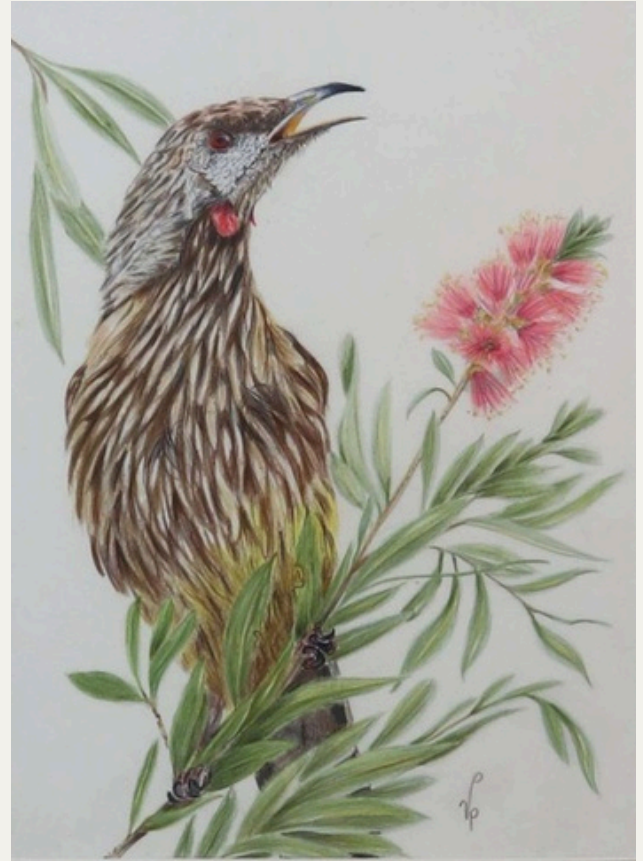
2nd Prize: Singing in the Day - Red Wattle Bird , Vivien Pinder